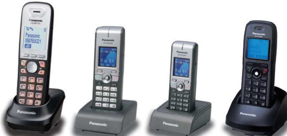
KX-WT115 Entry Level Model