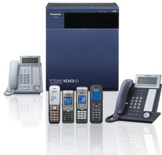
KX-TDA100D PRODUCT LINE UP

The KX-TDA100D PBX is a business platform your business can grow with. The system comes ready for use with extensive PSTN Phones, PSTN Trunks, IP Trunks, IP Phones, IP based CTI, and a whole family of business communication applications.